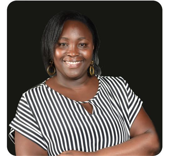
Lizzy People & Culture