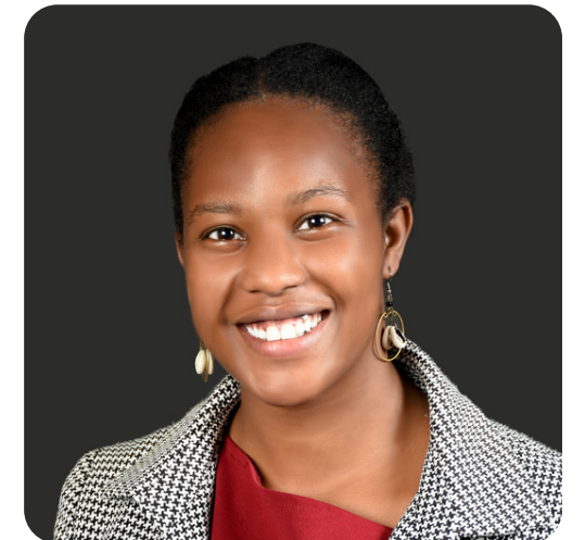
Sylvia Underwriting & Claims